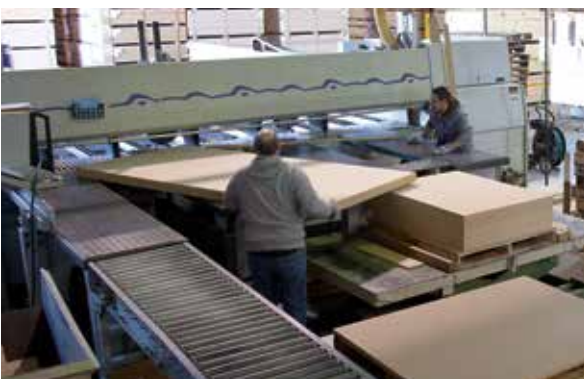
CabiNEXT can provide extra capacity to boost existing frameless output or provide a low-risk solution to help new manufacturers add frameless products.

CabiNEXT also eliminates significant time, labor and waste associated with manufacturing basic box components so you can focus more attention and resources on increasing market share, revenue and profits.